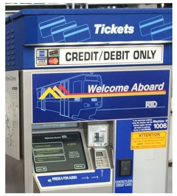
Ticket vending machine on platform

Once you have arrived at 1201 Larimer St, proceed to the 4th Floor for the workshop